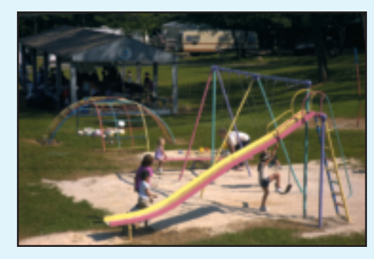
Playground, Beach Volleyball, Horseshoes, Boccie Ball, Croquet, Badminton.