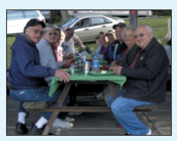
Friends and family gather for the Seasonal Guest Party.

Themed Weekends - Please check our website.